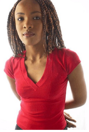
Meeting the needs of black females and special needs populations