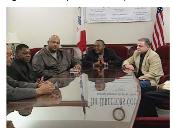
The Directors Council, Des Moines, IA

clients. Although federal law does not require states to contract with exclusively religious entities, 22 states adopted the charitable choice language into their own contracting process. Policymakers in many states are examining opportunities to engage sectarian organizations and work with them in new ways. In their deliberative sessions, many legislatures weighed the value of contracting with exclusively religious organizations against concerns about building their capacity to administer and provide services, challenges to maintaining accountability in contracting, and questions about the separation of church and state.